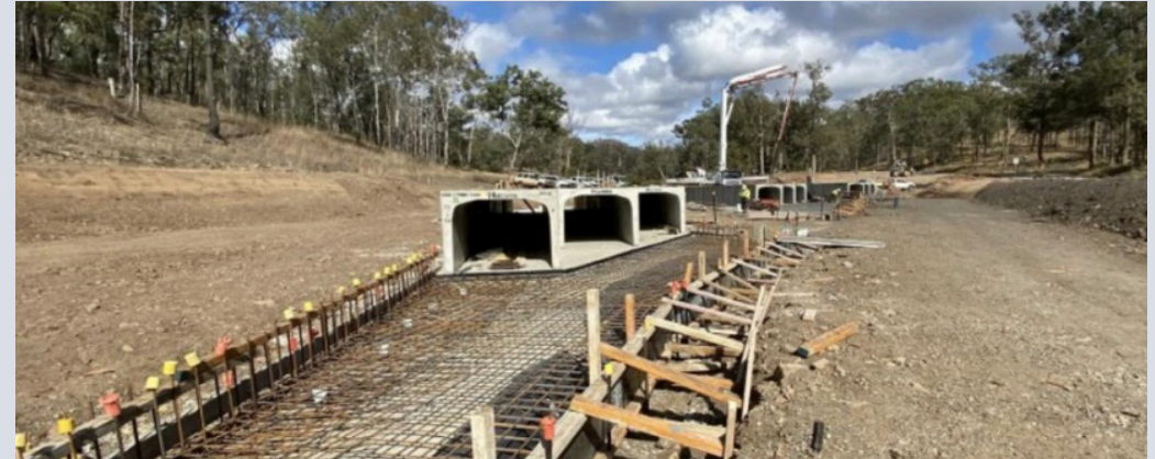
Image: Photo: Gladstone–Monto Road – preparation for pouring wingwalls and aprons

Eligible reconstruction works are jointly funded by the Commonwealth and Queensland Governments under the Natural Disaster Relief and Recovery Arrangements (NDRRA).