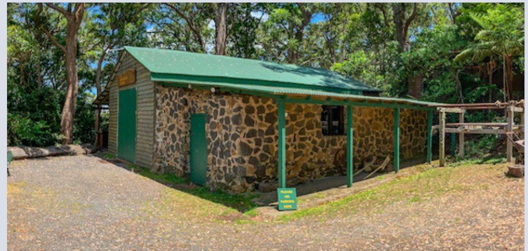
Images: The historic Binna Burra Barn, home to the new Bushfire Gallery – September 2020