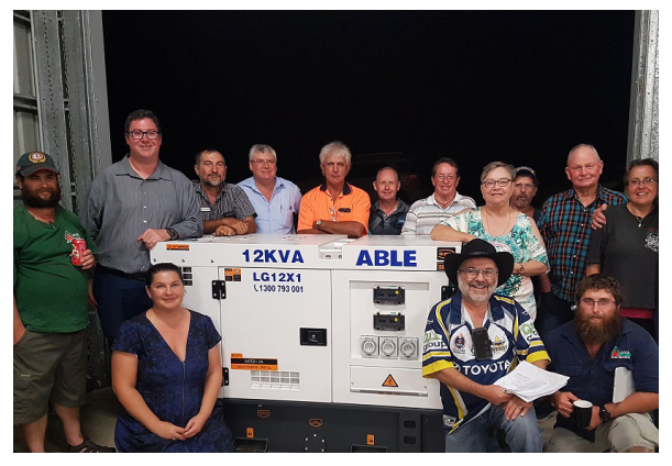
Image above: Habana Districts Progress Association Inc. received funding for a generator for emergency power supply.