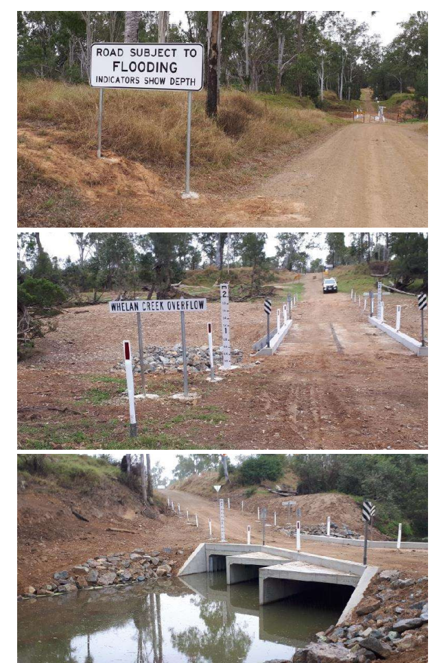
Images above: Isaac Regional Council replaced timber bridges along Collaroy Road.

A second round of funding is expected to be released in 2021.