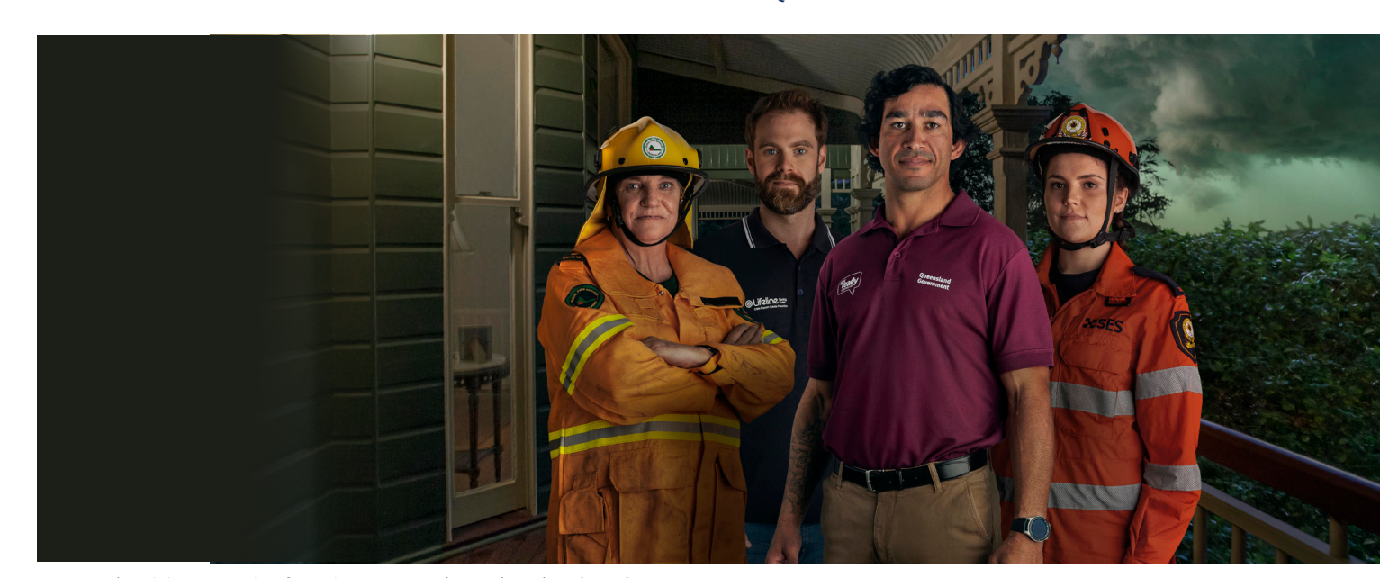
{\it Image: advertising\ campaign\ featuring\ GRQ's\ ambassador\ Johnathan\ Thurston}