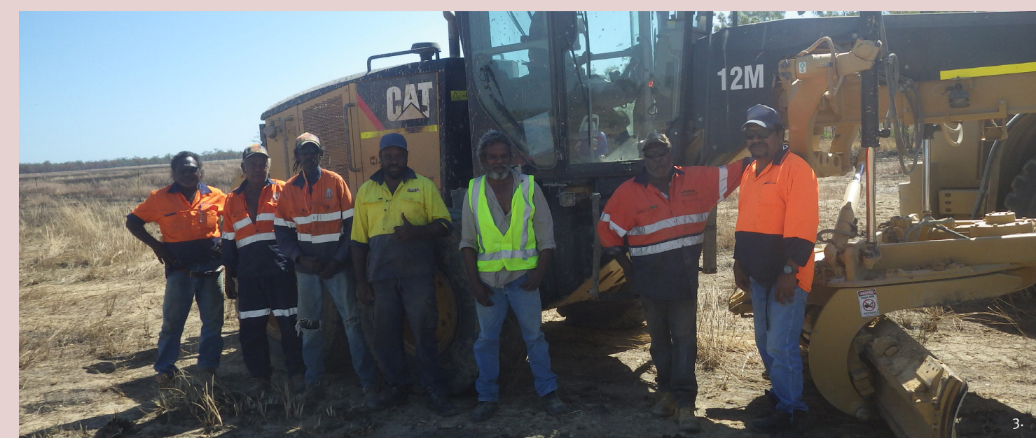
Images: (1.) Works in action (2.) Resealing complete (3.) Kowanyama Road Crew with newly purchased plant equipment.