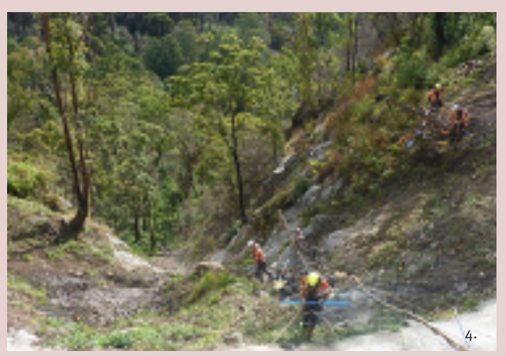
Images: (1.) Binna Burra Road – rock descaling with long reach excavator (2.) Binna Burra Road – drape mesh and rock gabions (3.) Binna Burra Road – rock gabions and drape mesh (4.) Binna Burra Road – workers abseiling down steep slopes to install soil nails.