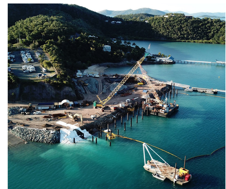
Image: Shute Harbour works in progress, Whitsunday Regional Council.