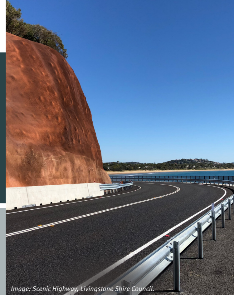
Image: Scenic Highway

From a $174 million investment, there is $397.5 million in avoided reconstruction costs*